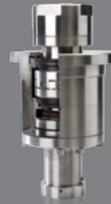
Tank top and bottom seal boxes

LATTY INTERNATIONAL S.A. 57 bis, rue de Versailles 91400 ORSAY - FRANCE Tel. +33 (0)1 69 86 11 12 sales-marketing@latty.com