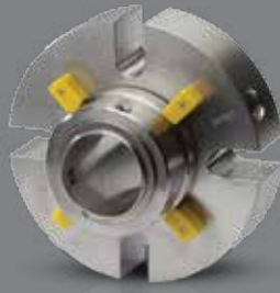
LATTY double mechanical seals

LATTY® ancillary systems are used with the following products: