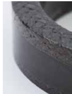
Composite ring consisting of a central ring of expanded graphite with compressed braided rings at the ends. The set provides a perfect sealing up to 1000 bar.